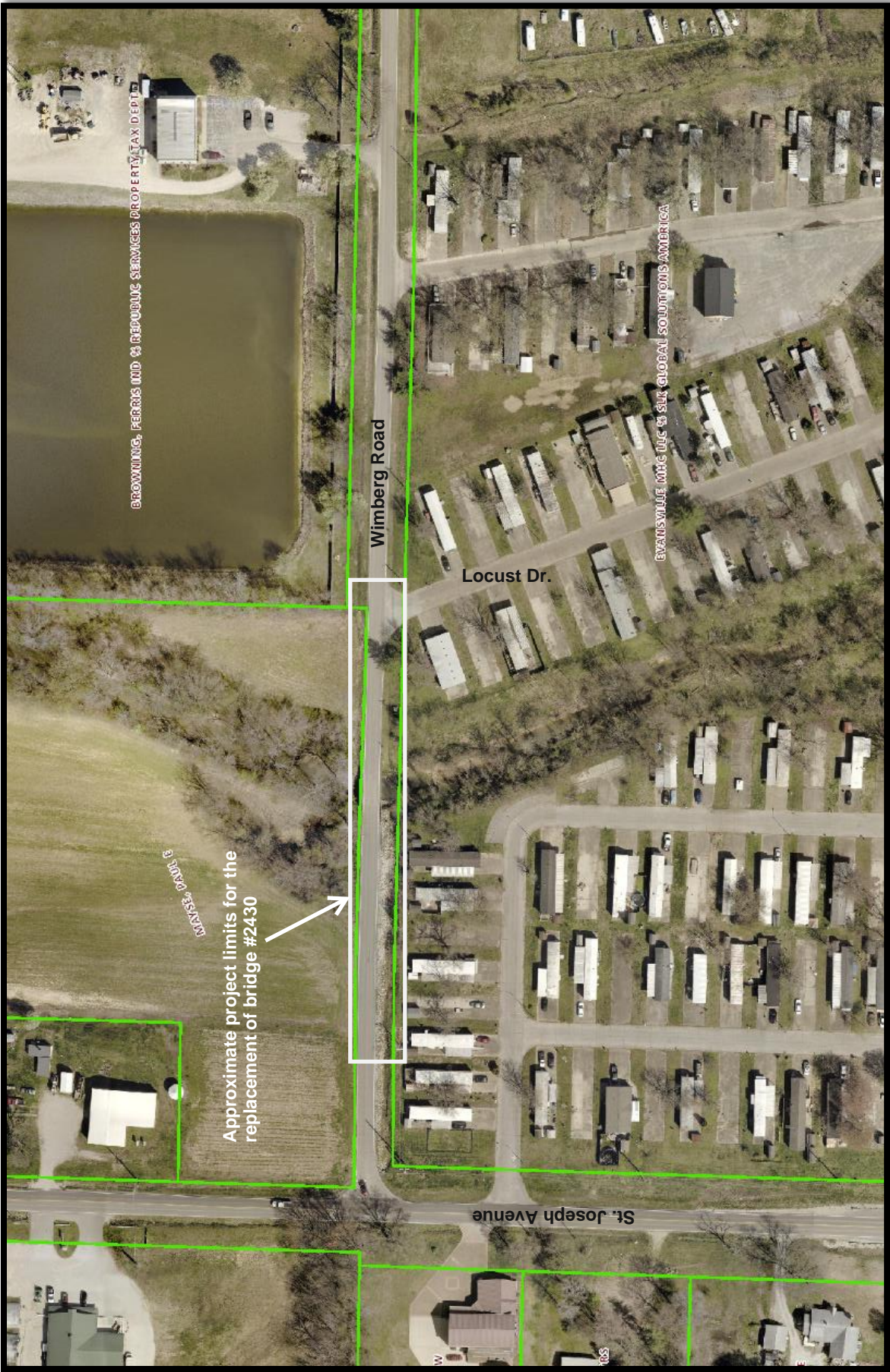
WIMBERG AVENUE BRIDGE #2430