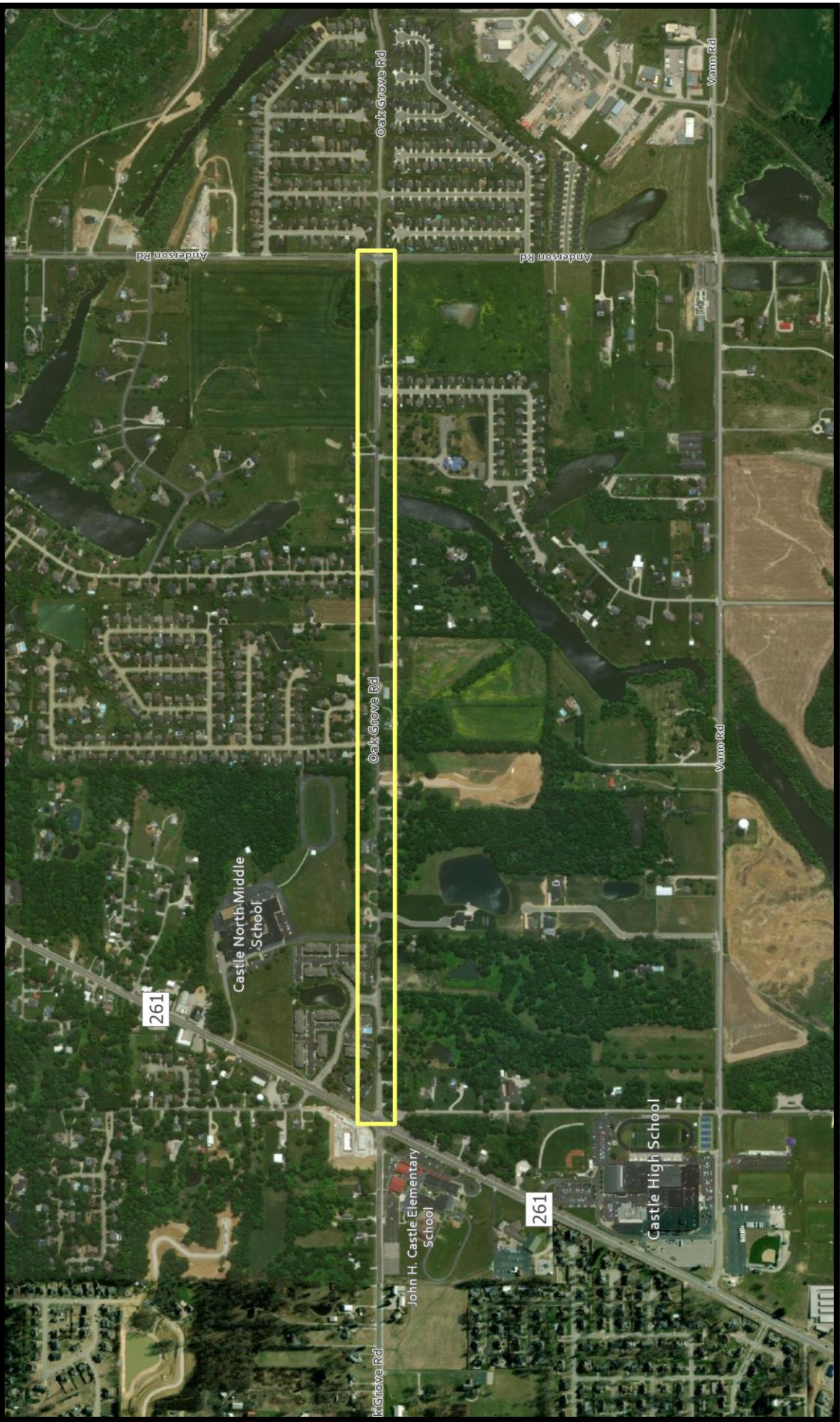
OAK GROVE RD from SR 261 to ANDERSON RD