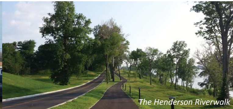
The Henderson Riverwalk