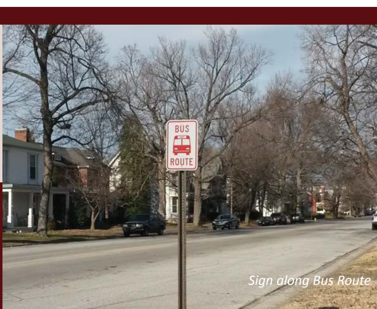
Sign along Bus Route