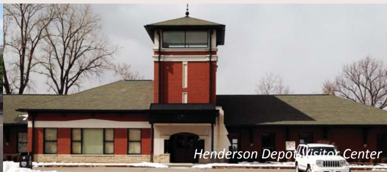
Henderson Depot/Visitor Center